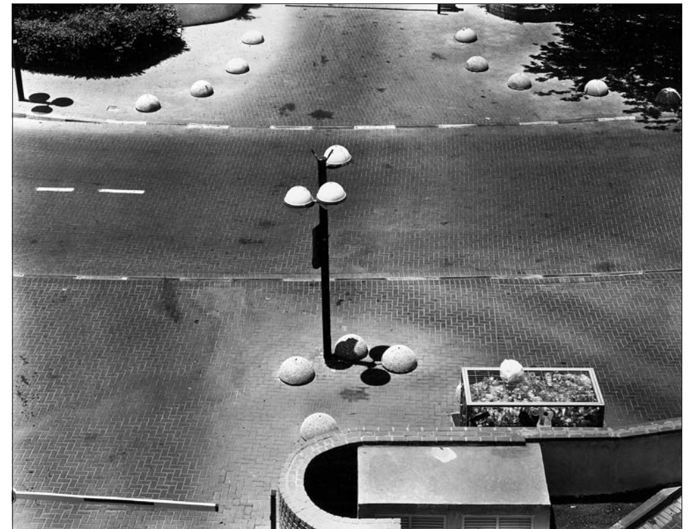
Azorei Hen N#1