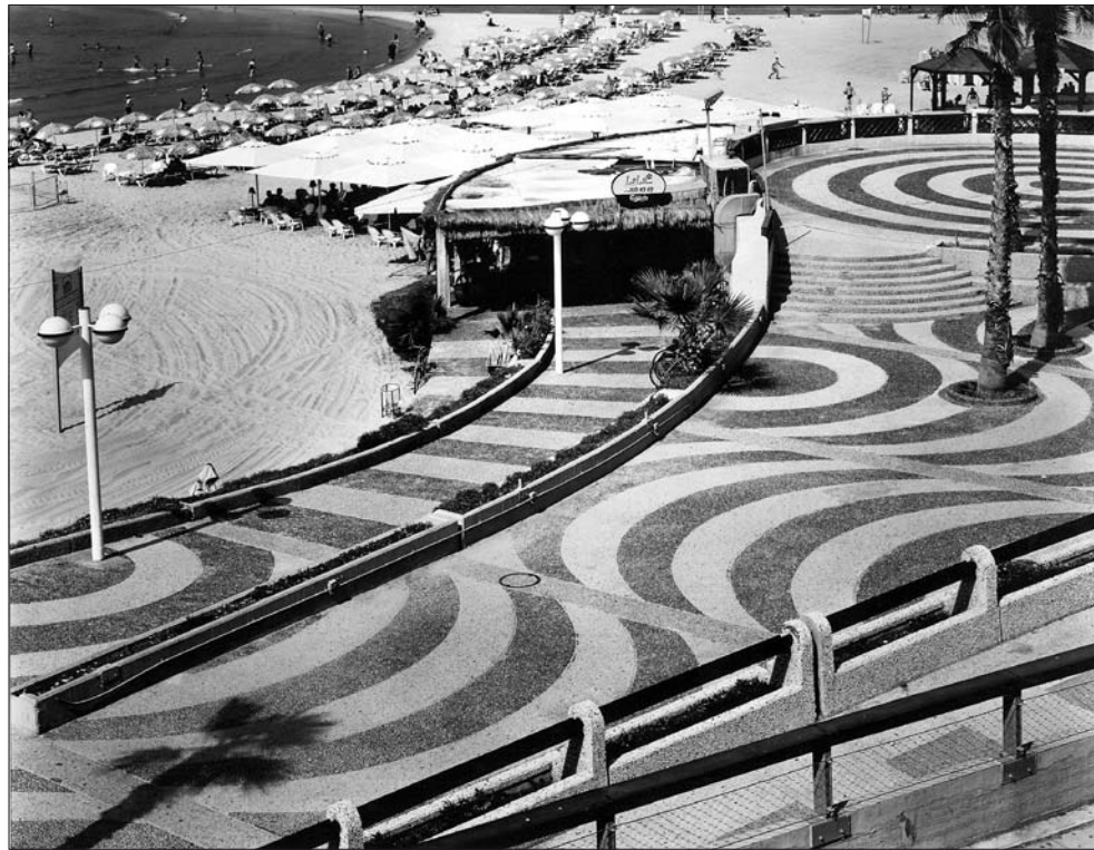
Gordon Beach N#2