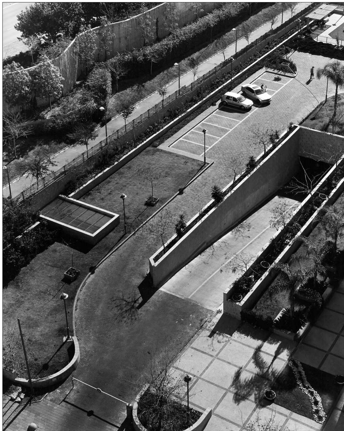
Azorei Hen N#3