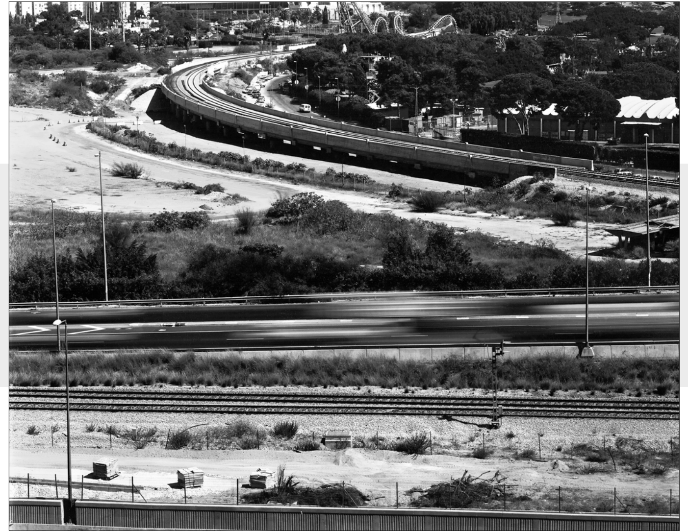
Ayalon Highway N#2

It is with these formal concerns in mind that I approached my latest project and saw in it an opportunity to create the equivalent of a book of poems. I wanted each photograph to stand by itself yet still share a language and a set of visual concerns with the rest of the series. These images are unified not by a narrative or conceptual framework, but rather by this shared fund of visual concerns. My aim with this photographic project is to create revelations about Tel Aviv, to redefine it visually and aesthetically.