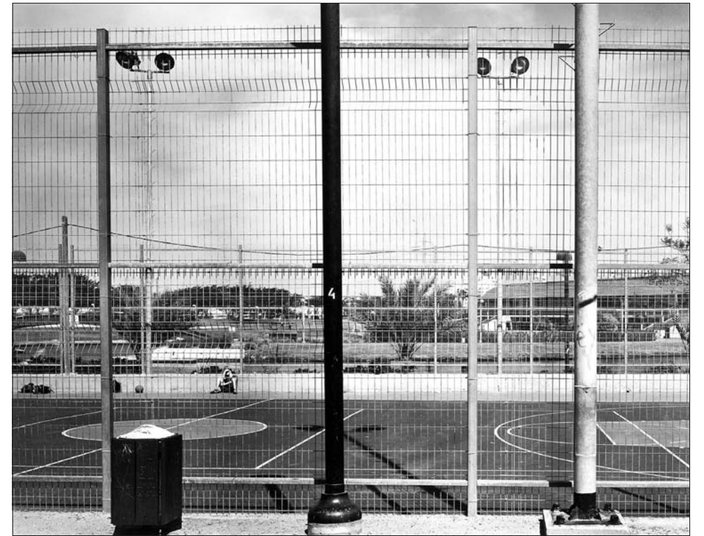
Ha Yarkon Park